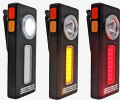
White/Yellow/Red Part no. 98315140

Flagger LED is the improved iteration of a model launched in 2019. Two LEDs were used: a white LED with stepless power adjustment from 150 to 500 lumens , and a white COB LED reaching 200 lumens. The maximal range of the beam is 158 meters . Flagger is now even easier to use and can be operated with gloved hands. Both LEDs can be activated with a single button, easy to feel with your finger. The flashlight can be also hanged on the integrated hook or firmly attached to metal surfaces (rail/pole/car etc.) with built-in magnets located in the back and in the base (see pictures above) . Flagger is powered by a rechargeable battery, good for up to 2.5 hours in the highest power mode and even 7 hours if only the COB LED is used . The kit includes a USB-C cable for recharging the flashlight.